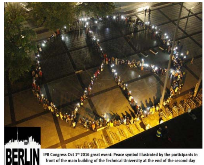
IPB Congress Oct 1 st 2016 great event: Peace symbol illustrated by the participants in front of the main building of the Technical University at the end of the second day